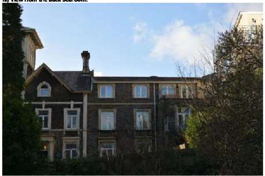
W) View from the Side/ front Garden